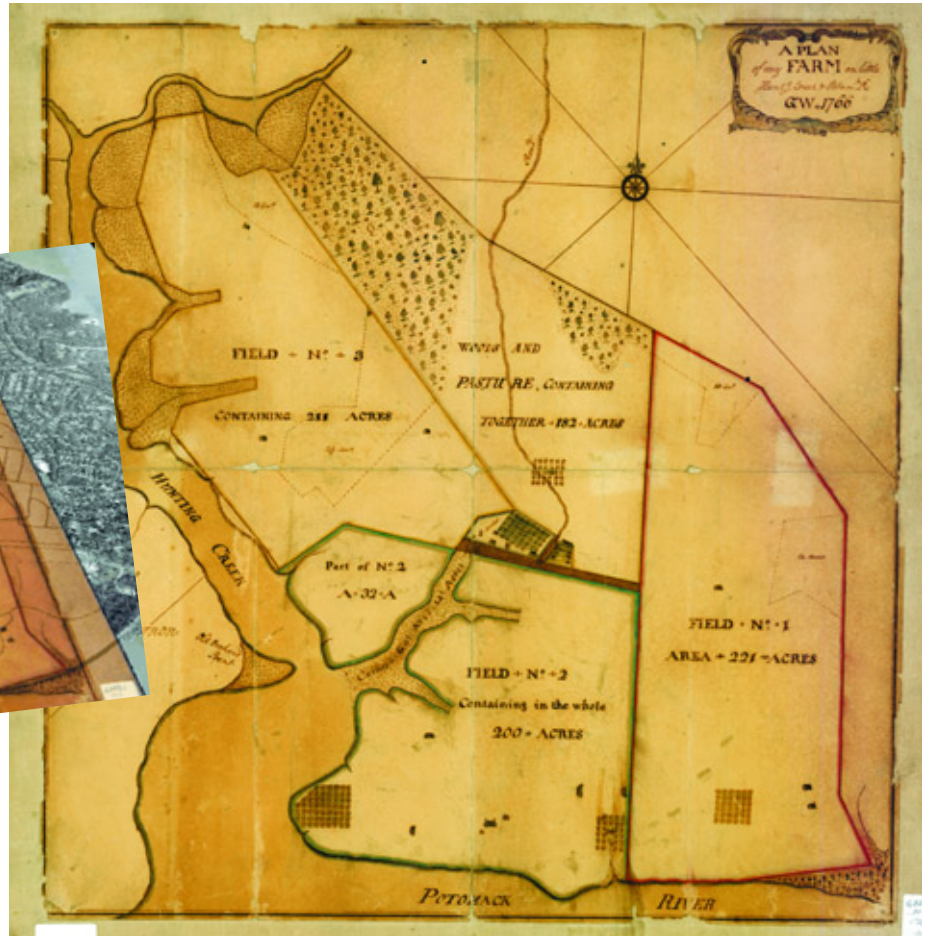
George Washington's original 1766 manuscript plat of his farm on Little Hunting Creek, near Mount Vernon. This map is among 12 original manuscripts, prepared by our first president, that are held in the Geography and Map Division.

and mission objectives. In the mid-1980s the Geography and Map Division mounted an exhibition of ACSM map competition winners. This time, the exhibition wishes to describe the currents of mapping as identified in the four major sections of the ACSM umbrella. Representation from the