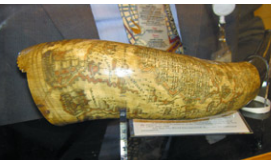
A map can be drawn anywhere! A powder horn contains a 1762 British map of Habana, Cuba and the Mohawk-Hudson River valley prepared during the French and Indian War. Other examples of maps on powder horns are found in the Geography and Map Division.

During a typical year, the Geography and Map Division provides a reproduction of a map to respond to Congressional queries, prepares scanned copies from its large collection for Congress and prepares maps on demand using geographic information systems technology to provide a graphic record where none existed before. The same challenges regarding directions of cartography, in the increasingly digital age, that are impacting the profession also impact the work of the division, as collecting concerns now include considerations regarding access, archiving, serving,